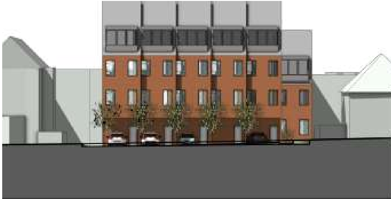
2 Front Elevation Scale: 1:200