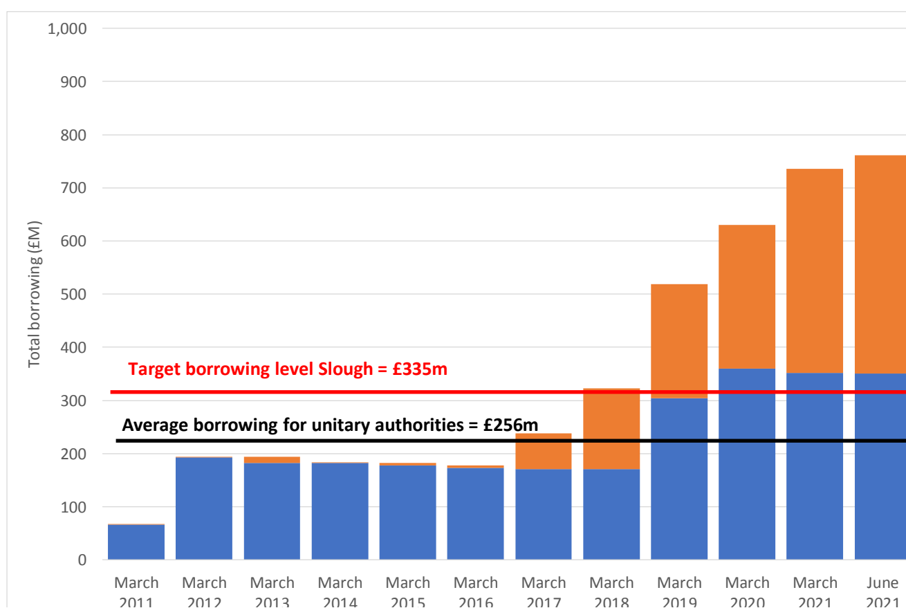
Chart 2 Total borrowing to date